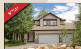
2441 Lower Lando Lane * 6 BD, 4 BA, 3500 Sq. Ft. * $450,000