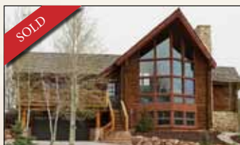
3340 Saddleback Road * 4 BD, 4 BA, 4167 Sq. Ft. * $695,000