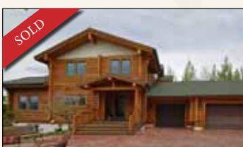
9143 Flint Way * 5 BD, 4 BA, 4680 Sq. Ft. * $749,000