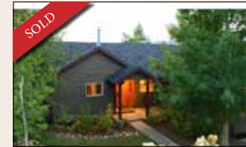
8888 Cove Drive * 4 BD, 3 BA, 3122 Sq. Ft. * $550,000