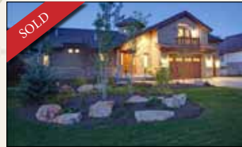
3064 Creek Road * 5 BD, 4 BA, 5510 Sq. Ft. * $995,000