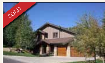
3810 Lariat Road * 5 BD, 5 BA, 5790 Sq. Ft. * $899,000