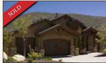
3122 Homestead Road * 5 BD, 5 BA, 4602 Sq. Ft. * $995,000