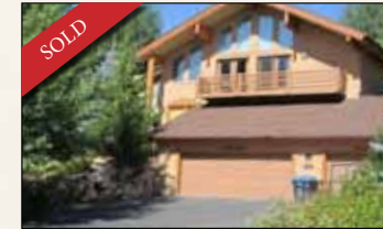
9158 Flint Way * 4 BD, 4 BA, 3900 Sq. Ft. * $599,000