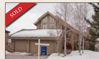
3951 Saddleback Road * 3 BD, 3 BA, 3924 Sq. Ft. * $495,000