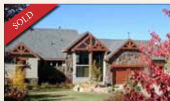
8918 Cheyenne Way * 4 BD, 4 BA, 4920 Sq. Ft. * $699,000