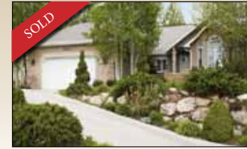
2584 Lower Lando * 5 BD, 3 BA, 4300 Sq. Ft. * $649,000