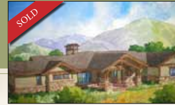
8929 Parleys Lane * 4 BD, 6 BA, 4950 Sq. Ft. * $1,697,000