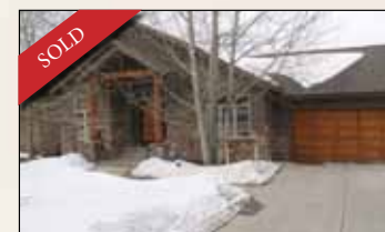
8995 Upper Lando Lane * 5 BD, 3 BA, 4200 Sq. Ft. * $529,000