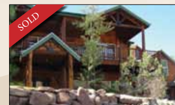
9071 Jeremy Road * 6 BD, 3 BA, 3891 Sq. Ft. * $489,900