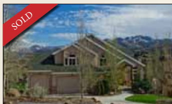
3125 Daybreaker Drive * 5 BD, 5 BA, 5170 Sq. Ft. * $940,000