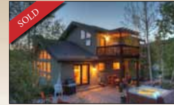
8772 Daybreaker Drive * 4 BD, 4 BA, 3534 Sq. Ft. * $619,000