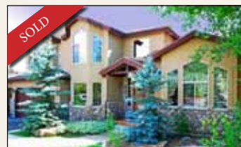
3933 Saddleback Road * 7 BD, 4 BA, 5229 Sq. Ft. * $899,500