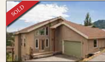
8940 Cove Drive * 4 BD, 4 BA, 4100 Sq. Ft. * $589,000