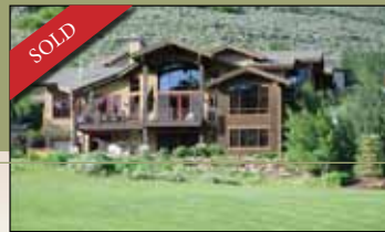
3349 Niblick Drive * 6 BD, 7 BA, 7300 Sq. Ft. * $1,795,000

Below is a detailed account of all properties sold in Jeremy Ranch last year.