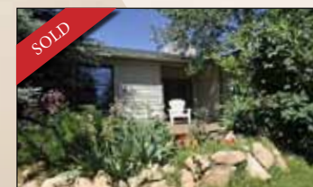
8813 Saddleback Road * 4 BD, 3 BA, 2030 Sq. Ft. * $399,000