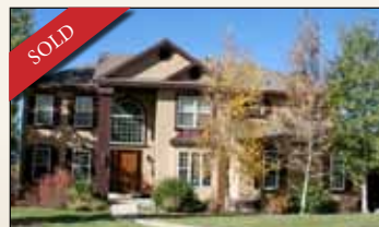
2440 Lower Lando Lane * 6 BD, 4 BA, 4909 Sq. Ft. * $679,000