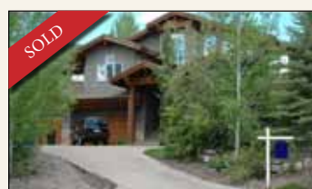
9010 Upper Lando Lane * 5 BD, 5 BA, 5780 Sq. Ft. * $745,000