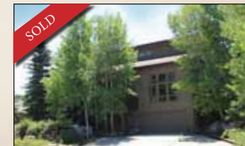
3555 Lariat Road * 3 BD, 2 BA, 2702 Sq. Ft. * $410,000