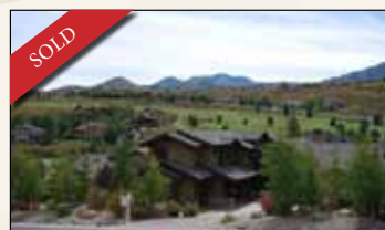
3342 Niblick Drive * 5 BD, 4 BA, 4512 Sq. Ft. * $880,000