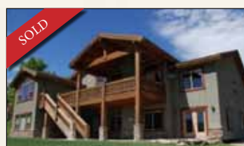
3717 Saddleback Road * 5 BD, 5 BA, 5368 Sq. Ft. * $799,000