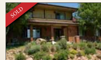
4000 Saddleback Road * 5 BD, 4 BA, 4788 Sq. Ft. * $449,000