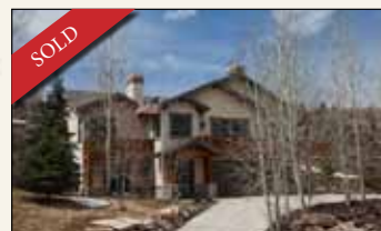
8895 Jeremy Road * 3 BD, 3 BA, 3932 Sq. Ft. * $800,000