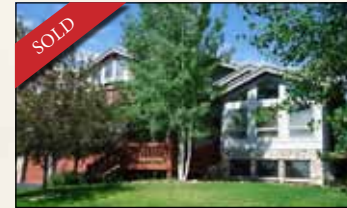
8920 Sackett Drive * 5 BD, 4 BA, 3998 Sq. Ft. * $598,000