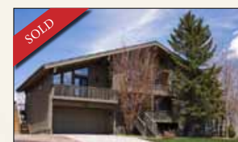
3780 Saddleback Road * 4 BD, 4 BA, 4197 Sq. Ft. * $479,000