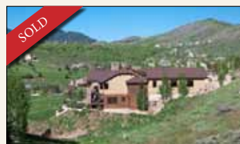
9275 Par Court * 7 BD, 6 BA, 4963 Sq. Ft. * $799,000