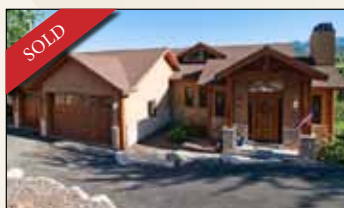
3269 Daybreaker Drive * 5 BD, 6 BA, 4534 Sq. Ft. * $840,000