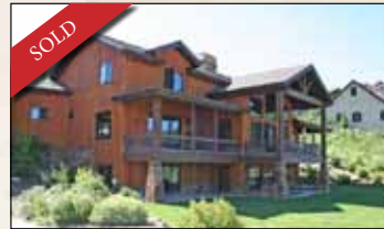
8611 Trails Drive * 6 BD, 7 BA, 7430 Sq. Ft. * $1,075,000