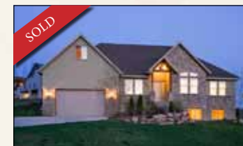
2805 Sackett Drive * 6 BD, 4 BA, 4312 Sq. Ft. * $547,500