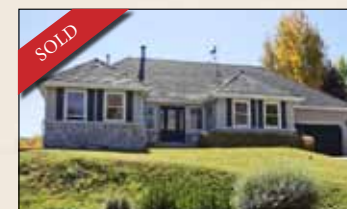
3805 Lariat Road * 5 BD, 4 BA, 5087 Sq. Ft. * $525,000