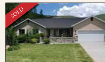
3078 Creek Road * 5 BD, 4 BA, 4384 Sq. Ft. * $524,900