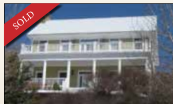
3504 Daybreaker Drive * 3 BD, 3 BA, 3531 Sq. Ft. * $679,000