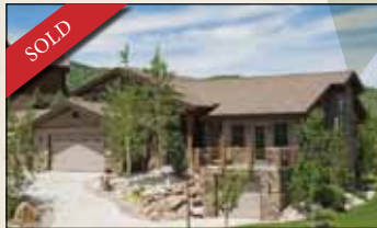
3320 Saddleback Road * 4 BD, 4 BA, 6030 Sq. Ft. * $1,048,000