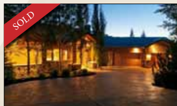
3473 Daybreaker Drive * 4 BD, 4 BA, 5375 Sq. Ft. * $945,000