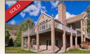
9235 Sandtrap Court * 6 BD, 5 BA, 5766 Sq. Ft. * $664,000