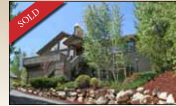
3141 Homestead Road * 4 BD, 4 BA, 3670 Sq. Ft. * $619,000