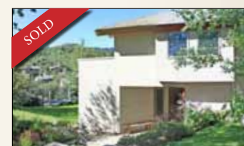
8781 Saddleback Road * 5 BD, 4 BA, 3016 Sq. Ft. * $479,000