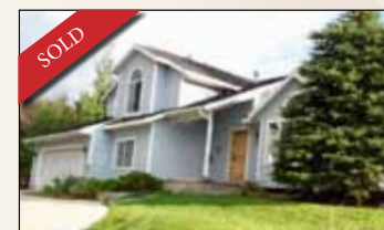
3530 Wrangler Way * 5 BD, 4 BA, 3200 Sq. Ft. * $499,900